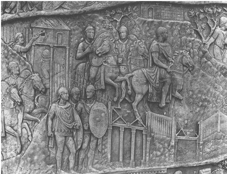
Fig. 3. Rome, Trajan Column: scenes 37-38.