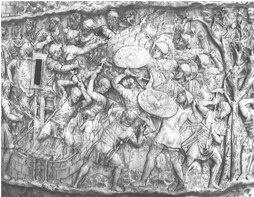
Fig. 5. Rome, Trajan Column: scene 24.