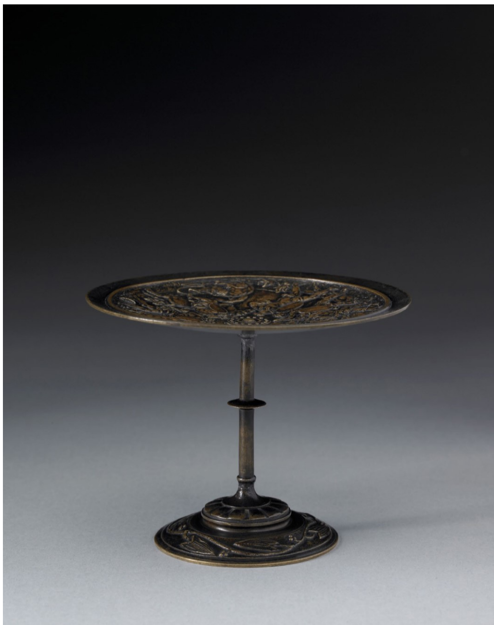
Fig. 1 Gilt-bronze goblet attributed to Galeazzo Mondella from Verona (Berlin, SB Sammlung).