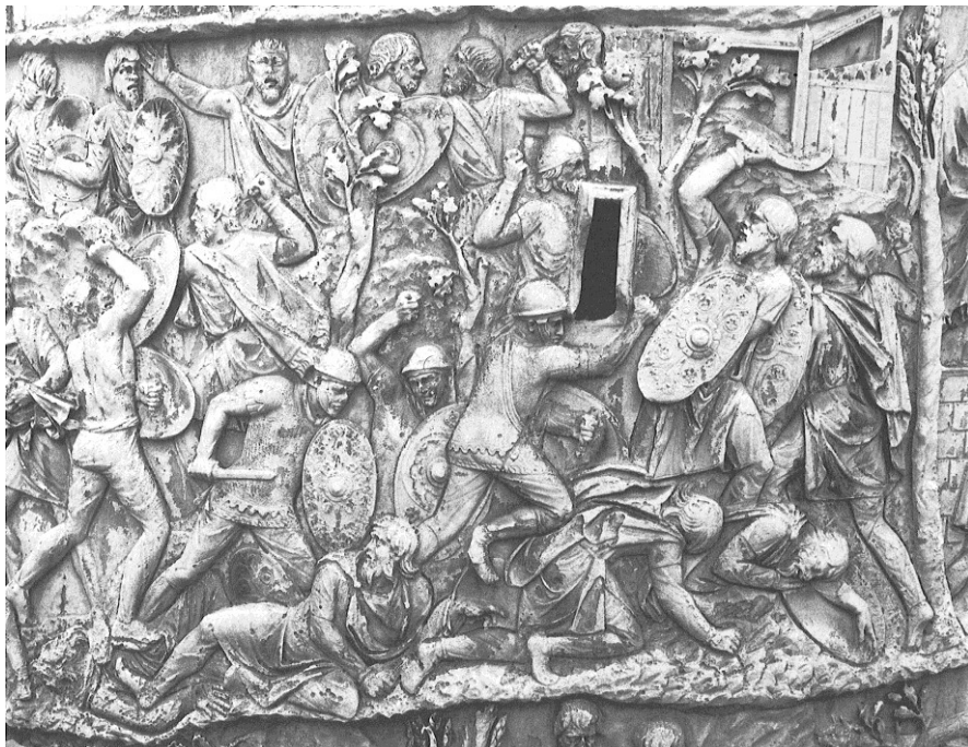
Fig. 7. Rome, Trajan Column: scenes 91-92.