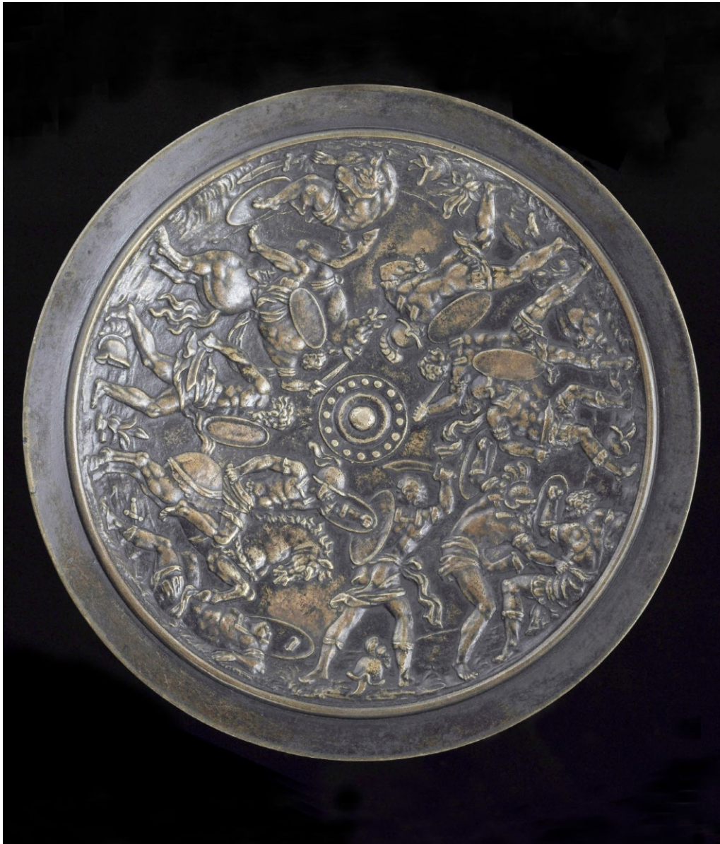
Fig. 2 Gilt-bronze goblet attributed to Galeazzo Mondella from Verona (Berlin, SB Sammlung).